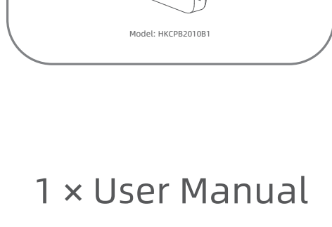
1 × User Manual